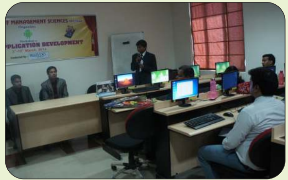
Trainers addressing Students