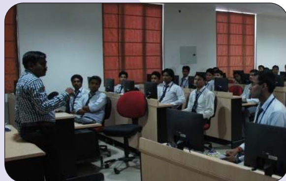
BCA Students attending Spoken Tutorial Workshop

IIT-Bombay and MHRD supported 'Spoken Tutorials' workshop was opened to the BCA students of SMS, perhaps for the first time. A series of Workshops on C and C++ were successfully organized by IIT Bombay in School of Management Sciences Varanasi campus through the video-conferencing learning mode exclusively for BCA Students. This programme is an initiative of the "Talk to a Teacher" project of the National Mission on Education through Information and Communication Technology, launched by MHRD, Govt of India. In this workshop IIT Bombay provides a series of Audio Video tutorials for the students that can be studied offline. The Spoken Tutorial project is about teaching and learning a particular FOSS (Free and Open Source Software) like Linux, Scilab, LaTeX, PHP & MySQL, Java, C/C++, LibreOffice etc.