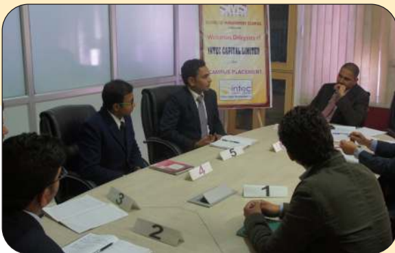
Placement Activities at SMS

In the vein of previous year, this year also School of Management Sciences announces with pride that we had achieved our objective of approx 100% placement for PGDMs (2013-2014) students at noticeable organizations. In both the phases i.e., first half (October – December 2013) & second (January – June 2014), student's recruitment in various organizations, more than three dozen Marketing, Finance, HR and IT companies arrived for campus