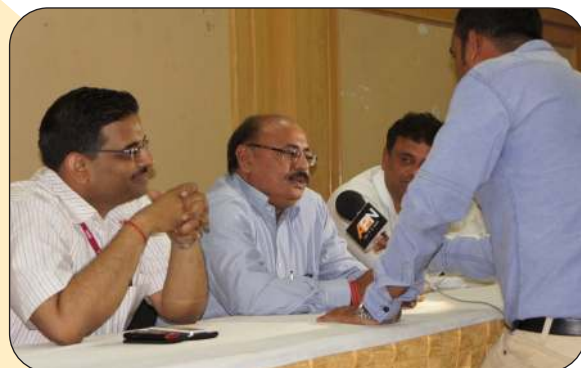
APN News interacting with Faculty Members

APN News at SMS Varanasi Campus on May 9, 2014 for a first hand coverage of BRANDING IN POLITICS programme. On this occasion, team APN interacted with students and faculty members. Later the programme was aired on the channel across India.