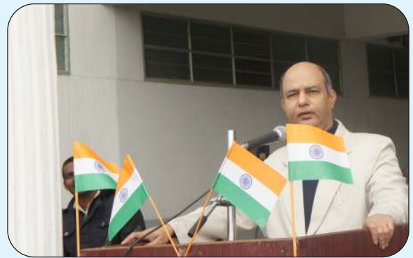
Director addressing on Republic Day