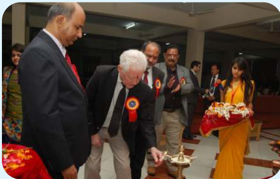
Lightening of Lamp by Chief Guest