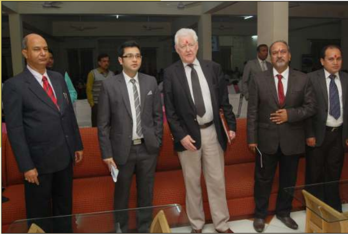
Guests of SKILLCON