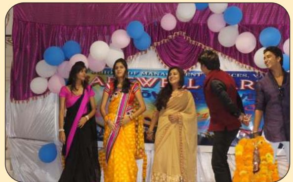
Students enjoying their Farewell Party

As another round of farewell ceremonies conclude, once again, the students of SMS organized farewell parties to their seniors. The