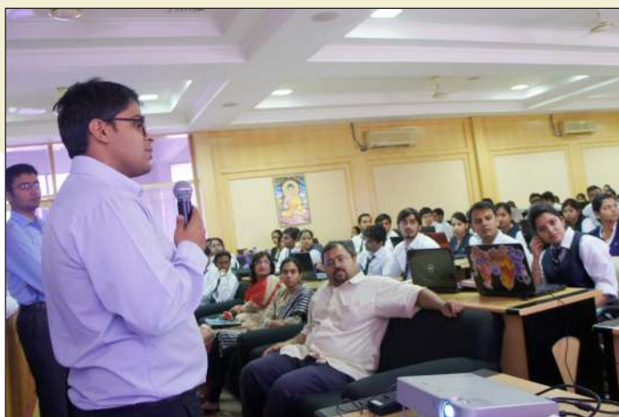
Trainer in Microsoft Excel Workshop