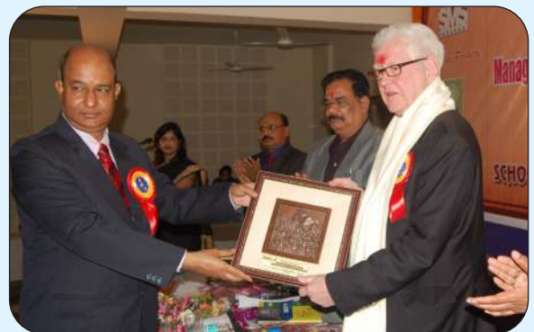
Token of Remembrance to Chief Guest