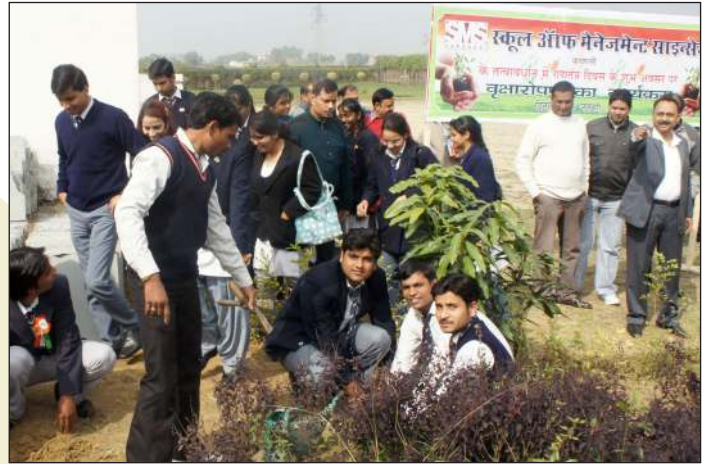
Plantation in Campus