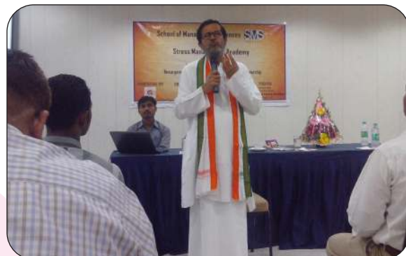
MDP on Mindfulness at Mumbai

“Mindfulness for Academic Excellence” held at Bunt Sangha's SM Shetty Educational Institutes, Hiranadani , Powai , Mumbai on April 16, 2014 was Jointly organized by School of Management Sciences, Varanasi and Stress Management Academy, Kolkata.