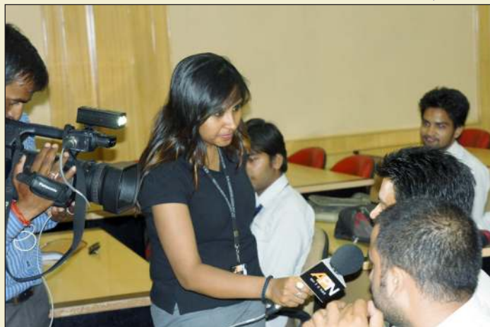
APN News interacting with Students