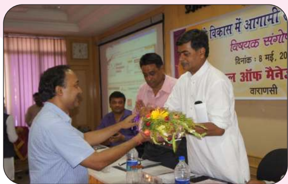
Registrar, SMS welcoming the Guest