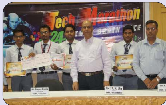
Winners of Tech Marathon