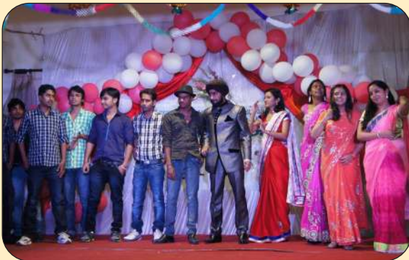
Students enjoying their Farewell Party

Don't be dismayed at goodbyes. A farewell is necessary before you can meet again. And meeting again, after moments or lifetime, is certain for those who are friends. ~Richard Bach