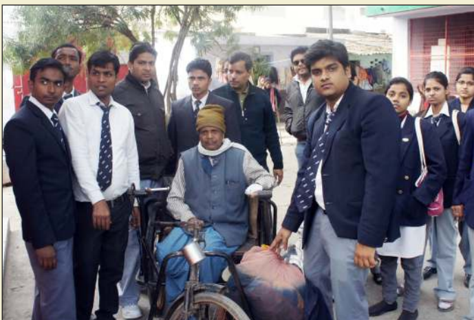
Cloth Distribution at Assi Ghat by SMS