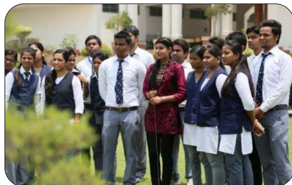
Finance Ki Pathshala

Doordarshan Team arrived at SMS to shoot one of the series of a programme called Finance ki pathshala where a team of academic experts from that particular institute solve the different finance related queries of the students. The objective of the programme is to create mass awareness in basic finance amongst the youth.