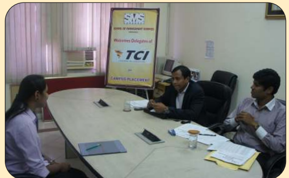
Placement Activities at SMS

selection especially for PGDM & MCA students. College invited companies operating in different functional areas including IT Sectors, Entertainment Sectors, Consumer Durable, Online Marketing, Securities, Auto Companies, Banks, FMCG Organizations, Transports, Pharma, Retail Giants & Infrastructure related Organizations. This year, SMS Varanasi explores the maximum possible placement opportunities for the students of both Management and Computers.