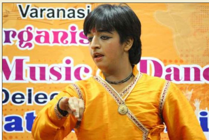
An Event of a Cultural Evening