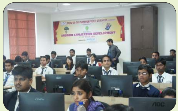
MCA Students in Android Workshop