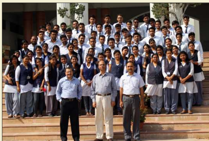
PGDM Final Year Students in a Photo Session