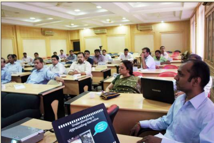
Faculties in Faculty Development Program