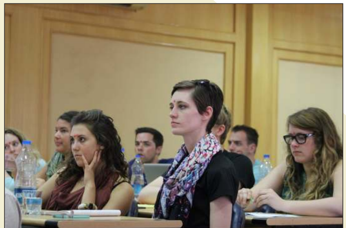
Students of Grand Valley State University in Workshop