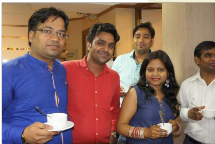
Alumni Meet, Delhi Chapter