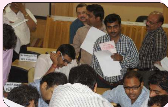
SMS Faculties in Brain Storm Session

only one – continue to do Research. He exhorted the faculty members to go beyond the rituals, develop attitude for Research. He talked at length about various facets of research Methodologies in Social Sciences and Computing. He also commented on strategizing Research. He stressed on the fact that there should be continuous training for the trainers and one must have the tendency even to 'unlearn' in order to learn new things. Later he also commented on the ethical issues of research.