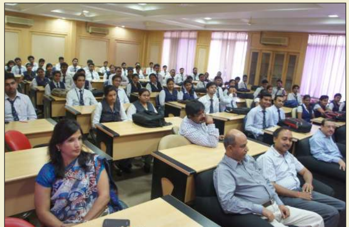
PGDM Students in a Program