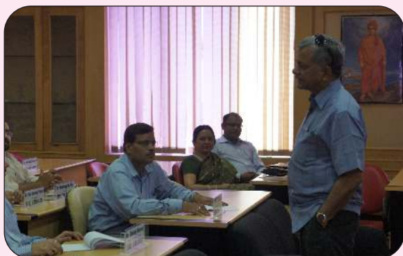
Faculties in discussion with Trainer