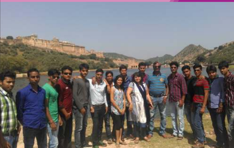
PGDM Students with Faculty Members at Jaipur

Industrial cum educational tours were planned for the courses including PGDM, MCA & BCA. Agra and Jaipur visit was arranged for PGDM Students while Jim-Corbett, Nainital and Pangot visit was arranged for MCA & BCA Students.