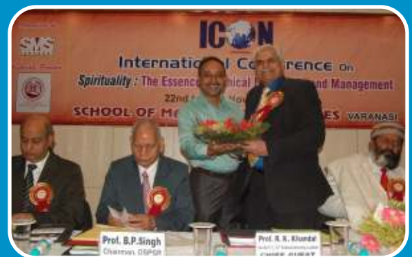
Registrar - SMS welcoming V.C. - UPTU

The Essence of Ethical Leadership & Management was organized by Centre for Spirituality and Human Enrichment (C-SHE, SMS, Varanasi) in association with Claflin University, USA.