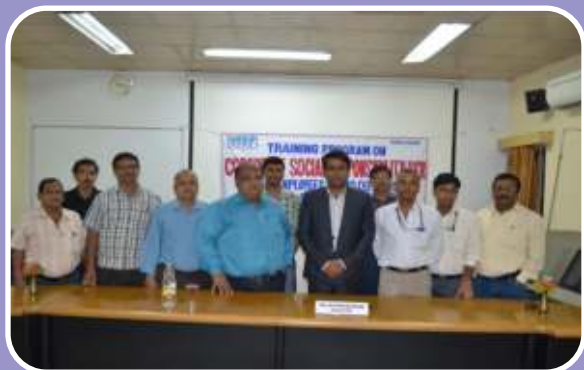
Participants of two day workshop on CSR in NTPC, Kahalgaon

Centre For Entrepreneurship, Innovation & Skill Development of School of Management Sciences has got the Consultancy Project on ongoing basis of Agnivesh Ayurved Healthcare Pvt. Ltd., an upcoming Start Up Entrepreneurial Venture in the field of Ayurvedic Pharmaceuticals in Varanasi.