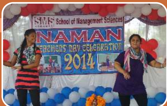
Students showcasing their talents on Teacher's Day "Naman"