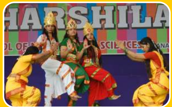
Students Showcasing their talents in Cultural Programme

The Institution celebrated its 20th Foundation Day "Adharshila" amidst joyous fervor and competitive spirit with over 15 teams participating in the day long competitive events covering four events in academic and cultural arenas.