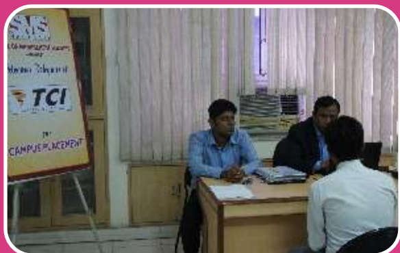
Students giving their interviews in placement process