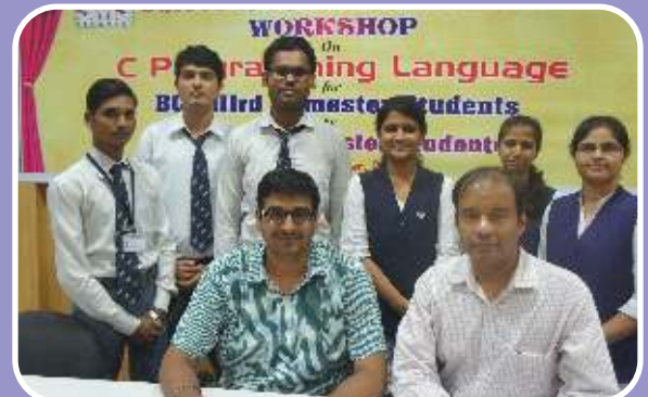
MCA Students along with Faculty Members