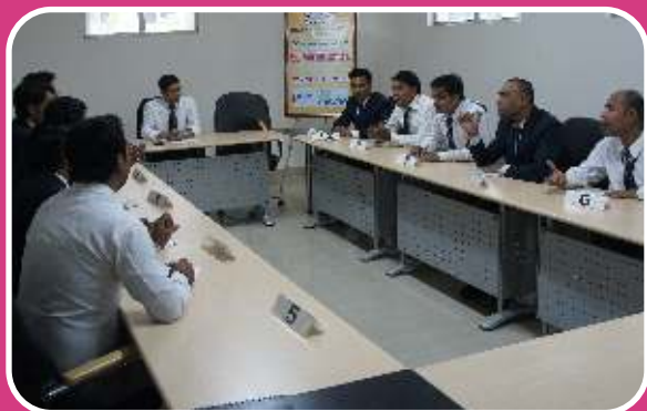
Students interacting in Group discussion, Step in Placement Process