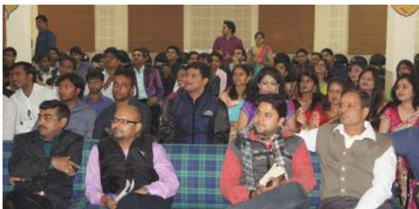
Faculties & Students Witnessing Fresher's Party