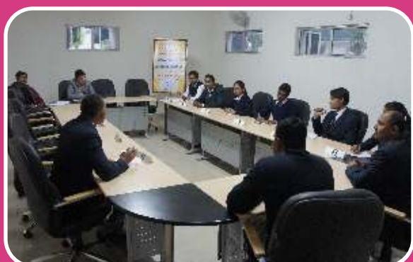
Placement activities of SMS