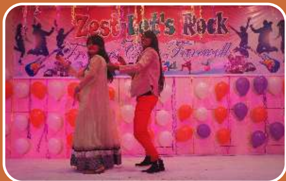
Student's performing on Fresher's Party

The students of different courses i.e. MBA, MCA, PGDM, BBA & BCA have organized fresher's & welcome party for their Juniors at the SMS Varanasi campus. The programme filled with Music, dance, songs, laughter helped in breaking the ice between the seniors and juniors, It also gave the juniors a platform to showcase their talents. The senior batch had put a lot of efforts to make the day memorable for their juniors.