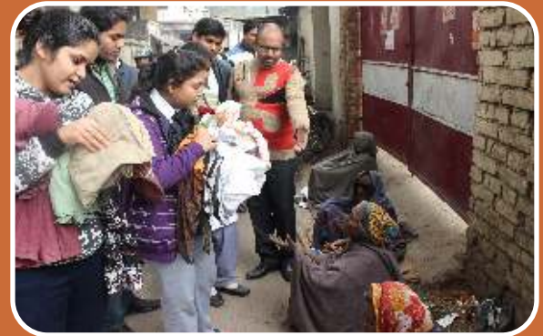
Faculties along with students during cloth distribution activity

Social Welfare club of SMS, "Rainbow" organized a two days Cloth Donation Programme for economically weaker section.