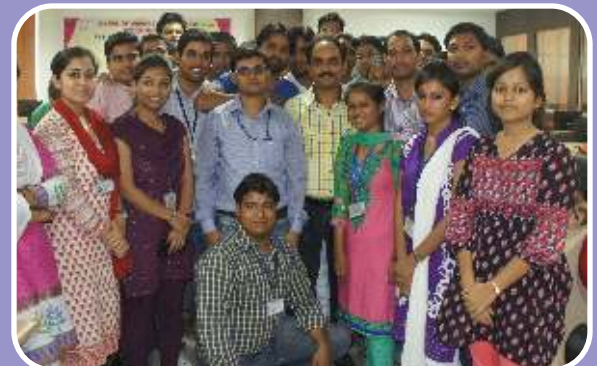
MCA Students who attended Workshop along with Trainer