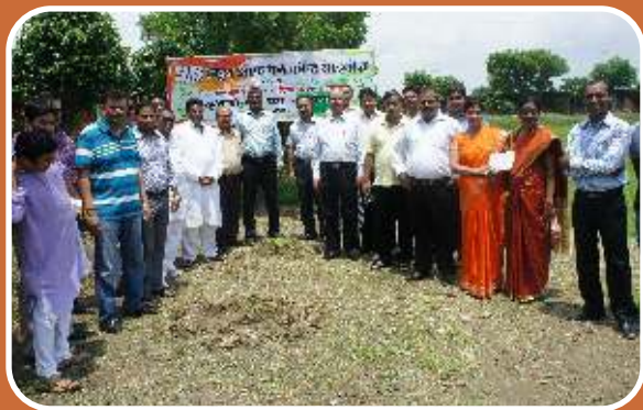
SMS Family member's on the Occasion of plantation