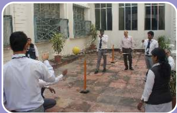
Students during Personality Assessment Activities