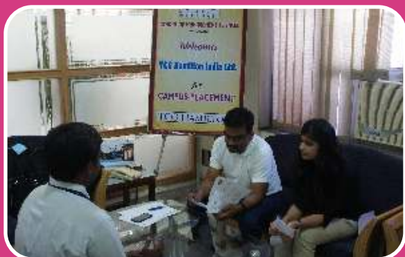
Interviewer talking interviewee during placement process

Likewise every year, this year too in the same fashion, SMS arranged a scheduled and well-planned Placement Season divided in two phases. The first phase initiates from the month of October and ends by December 31st, further followed by the second phase from January onwards to supplement the activities of first phase. This year also, numbers of corporates have appreciated potential of student in PGDM, MBA, MCA and other courses at SMS, Varanasi.