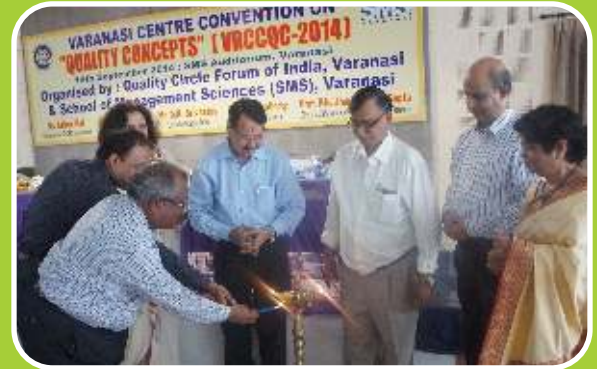
Members of Quality Circle Forum during the Inaugural

The convention also witnessed knowledge test for QC Team members, Essay/Poster/ Poem/ Slogan competition, Model Exhibition, Quiz Contest and Cultural Programme. QFCI Books exhibition and Varanasi Handicraft Exhibition cum sale were the special attractions of the convention.