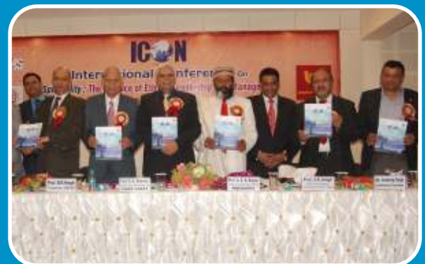
Unveiling of Conference Souvenir by Dignitaries

The Essence of Ethical Leadership & Management was organized by Centre for Spirituality and Human Enrichment (C-SHE, SMS, Varanasi) in association with Claflin University, USA.