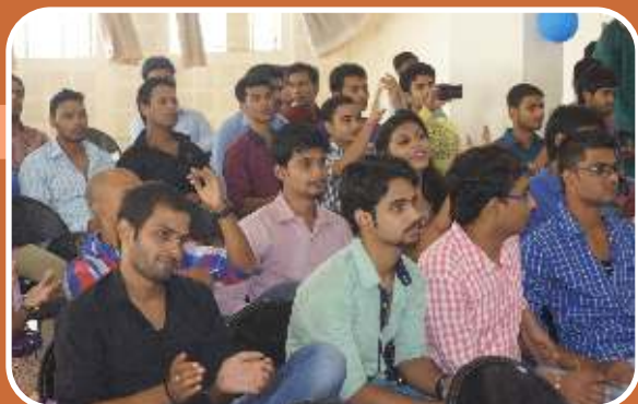
Student's during Fresher's Party

Every Year, on 5th of September students celebrate the Teachers day with immense passion and zeal. On this day, our students performed various cultural events in the honour of their respected teachers. On this auspicious occasion the heart touching dance performance by the students depicted the different festivals and personalities of the country. Like every year this year also Teachers showcased their talents in several categories of events including Singing and Antyakshari. The unmatched performances by the teachers and the students make "Teacher's Day" memorable and everlasting in the memories of all which everyone cherishes. At the end of the function, teachers are felicitated by the students with a token of remembrance. This event happens to be the trait of teacher-student harmony in the institution.