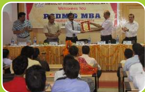
Director, SMS felicitating guests in Orientation Programme of P.G.D.M & M.B.A