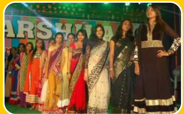
Students of SMS in Fashion Show

The Institution celebrated its 20th Foundation Day "Adharshila" amidst joyous fervor and competitive spirit with over 15 teams participating in the day long competitive events covering four events in academic and cultural arenas.