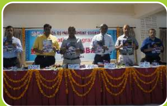
Unveiling of SMS Publication by Guests