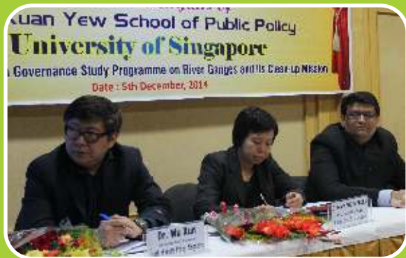
Faculty Members from University of Singapore during session