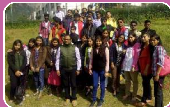
Students of B.C.A/ M.C.A with Faculty Members in Nainital

Industrial cum educational tours were planned for the courses including PGDM, MCA & BCA. Agra and Jaipur visit was arranged for PGDM Students while Jim-Corbett, Nainital and Pangot visit was arranged for MCA & BCA Students.