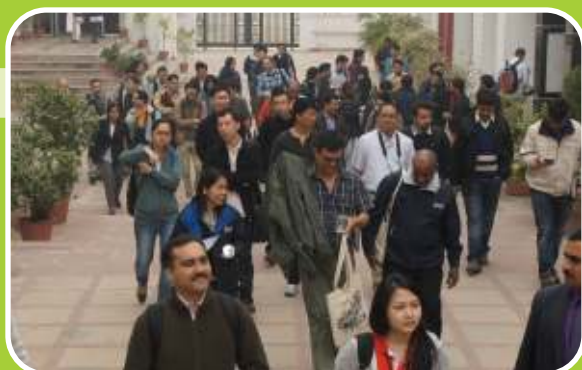
Campus Visits of Delegates from University of Singapore