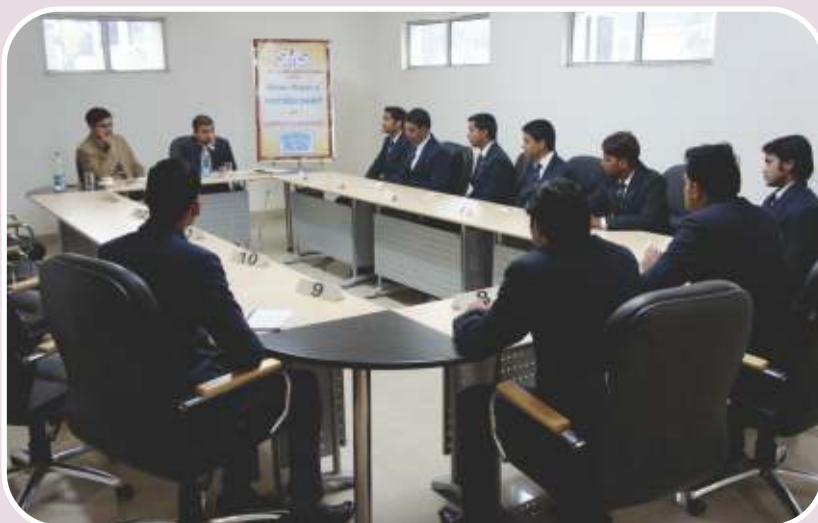
Group Discussion in Campus Recruitment