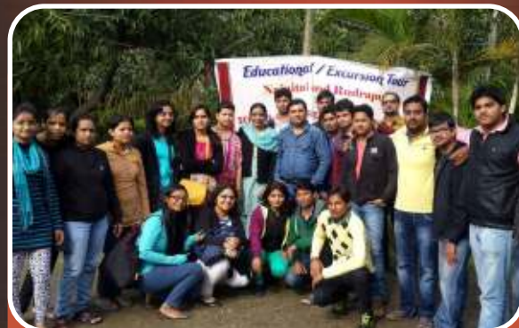
MBA students during their Excursion Tour to Nainital