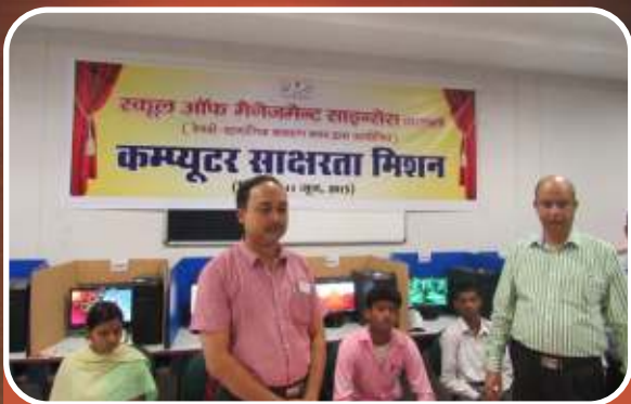
Director & Registrar at Computer Literacy Awareness Program