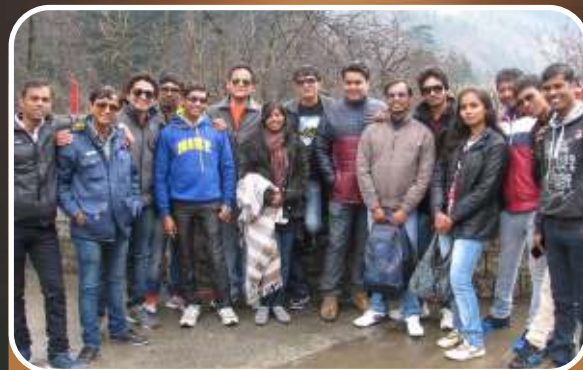
MCA students during their Excursion Tour to Manali

Students of MBA visited world's leading IT Company, Hewlett Packard at Rudrapur, India's leading manufacturer of biscuits and confectionary and the makers of the world's largest selling Biscuits "Parle-G" at Pantnagar