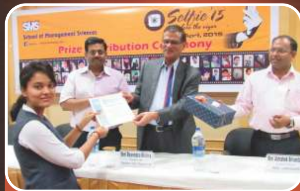
Prize Distribution to Selfie Contest Winners

The Centre For Entrepreneurship, Innovation & Skill Development (CEISD) of SMS, Varanasi has helped in launching an Ayurvedic Pharmaceutical, Agnivesh Ayurved Healthcare (P) Ltd, Varanasi as a green field project. CEISD is also giving them consultancy on regular basis to launch its 30 Ayurvedic Proprietary, Classical Medicines, OTC and FMCG Products in different therapeutic segments in the selected pockets of Eastern UP region. CEISD has also helped to successfully get ISO 9001:2008 by the International Accreditation Body JAS-ANZ to the Agnivesh Ayurved Healthcare (P) Ltd. CEISD is in verge of providing GMP Certification to the Agnivesh Ayurved for its Drug Standardization and the Total Quality Management System.