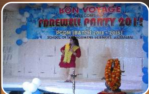
Student Showcasing her Talent at Party