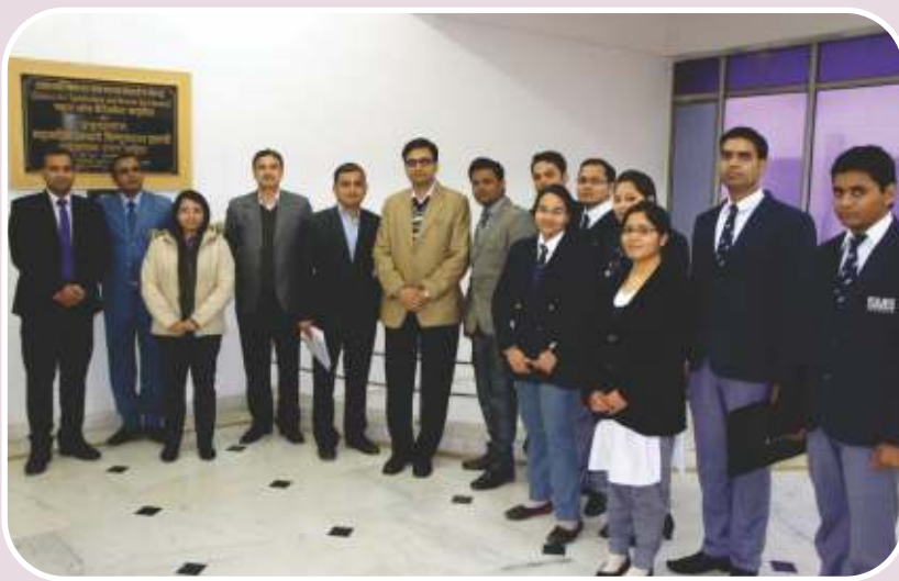
Industry Delegates along with Placed Students

Like every year, this year also School of Management Sciences announces with glory and pleasure that we succeeded with approximately 100% placement for PGDMs (2013-2015) students at the organizations of repute. In both the phases i.e., first half (October – December 2014) & second (January – June 2015), student's recruitment in various organizations, more than three dozen Marketing, Finance, HR and IT companies arrived for campus selection especially for PGDM & MBA students. We have invited companies from different functional areas including IT Sectors, Entertainment Sectors, Consumer Durable, Online Marketing, Securities, Auto Companies, Banks, FMCG Organizations, Transports, Pharma, Retail Giants & Infrastructure related Organizations. Companies have recruited students for various management positions at striking packages ranging from 3-6 Lacs per annum, highest being above 6.0 Lacs per annum.