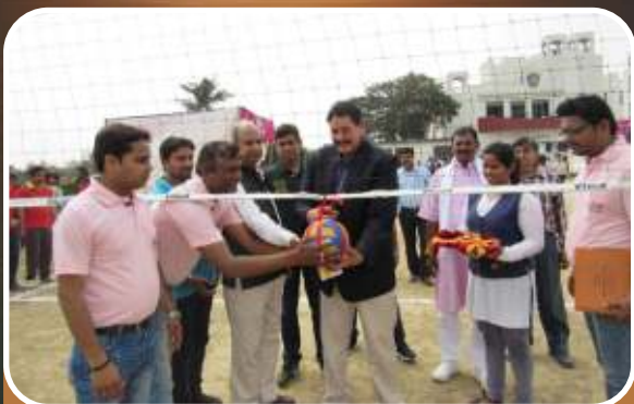
Chief Guest Inaugurating Volleyball Game