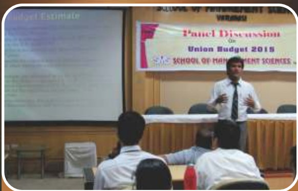
P.G Student Participating in Union Budget 2015

“ This Nine Days Workshop was organized by Agile Softech Private Limited for the Students of MCA 4th Semester ”