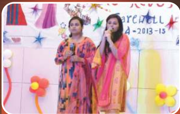
Students Performing at Farewell Party