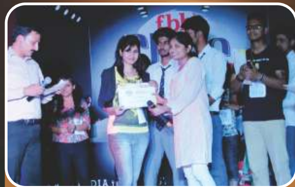
Prize Distribution to the Winners of FBB Style Icon Talent Hunt