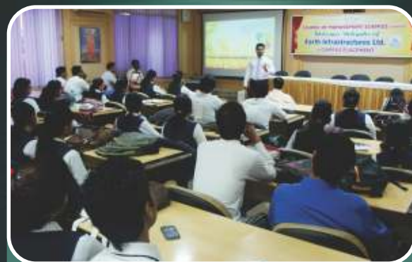
Company Presentation during Placement Activity