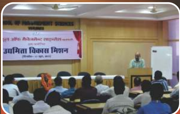
Director Interacting with Participants of EDM Program