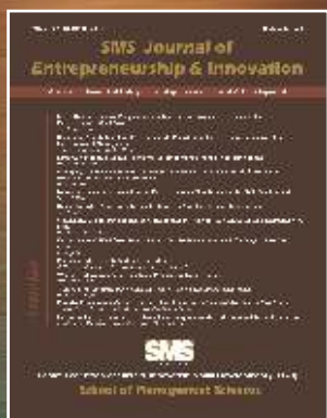
First Issue of SMS Journal of Entrepreneurship & Innovation