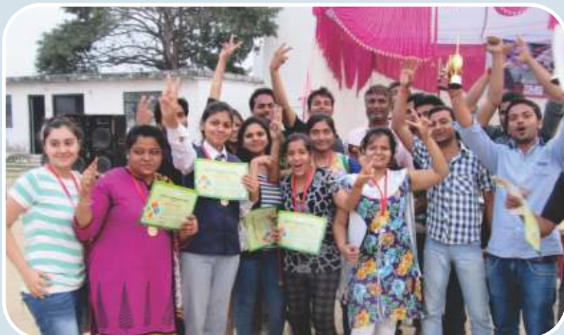
Students Enjoying the Sports Event