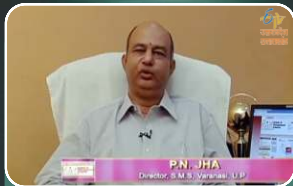
ETV at Campus