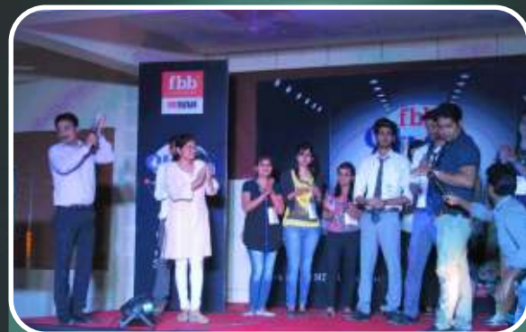
Performances at FBB Style Icon Talent Hunt