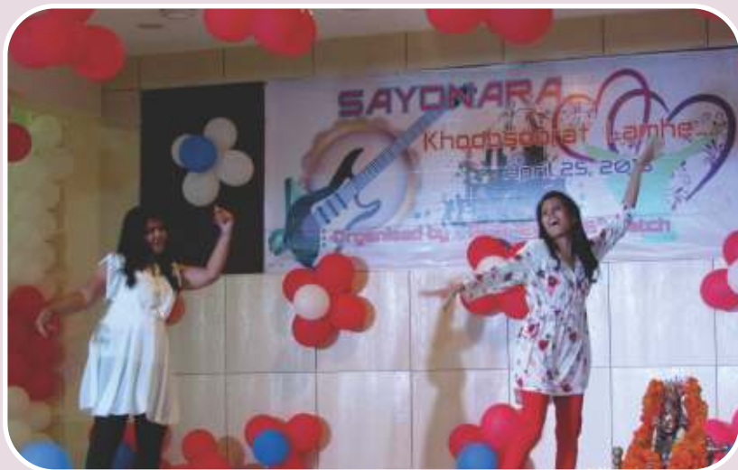
BCA Students Rocking the Floor at Farewell Party