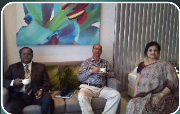
Director, SMS - Varanasi along with NAAC Peer Team Members