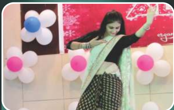
BBA Student in Madhuri Dixit Style