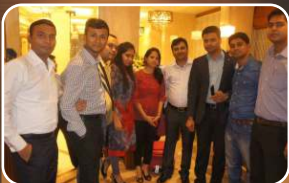
SMS Alumni Meet at Mumbai