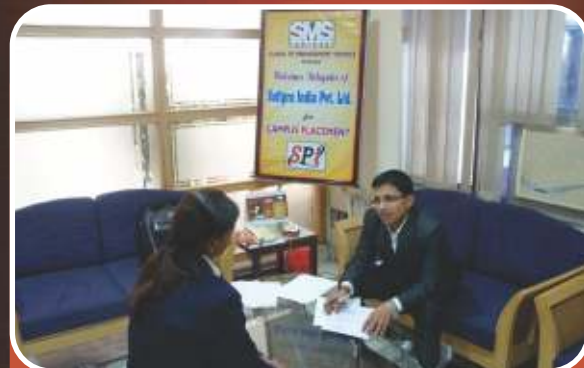
Personal Interview during Placement Activity

“Companies have recruited students for various management positions at striking packages ranging from 3-6 Lacs per annum, highest being above 6.0 Lacs per annum”