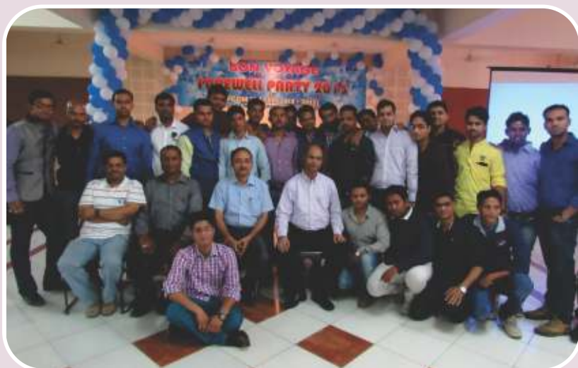
PGDM Students with their Faculty Members during Farewell Party

You and I will meet again When we're least expecting it One day in some far off place I will recognize your face I won't say goodbye my friend For you and I will meet again --Tom Petty