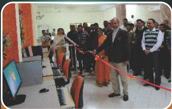
Director Inaugurating Digital Harbor at SMS Library