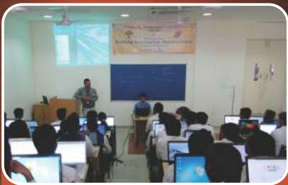
Trainers addressing MCA Students at Workshop

“ This Nine Days Workshop was organized by Agile Softech Private Limited for the Students of MCA 4th Semester ”