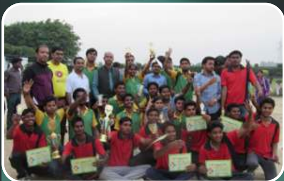
Faculty Members along with Winning Team