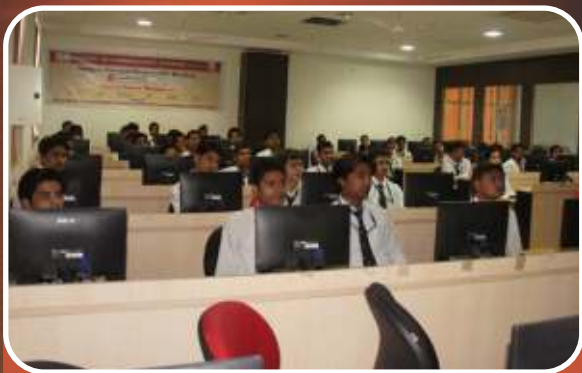
UG Students Participating at Spoken Tutorial Workshop