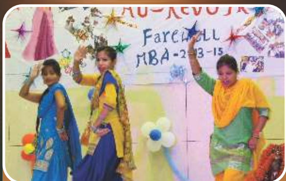
MBA Students Performing at Farewell Party