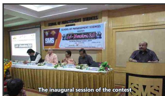
The inaugural session of the contest