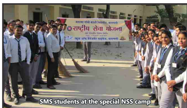
SMS students at the special NSS camp