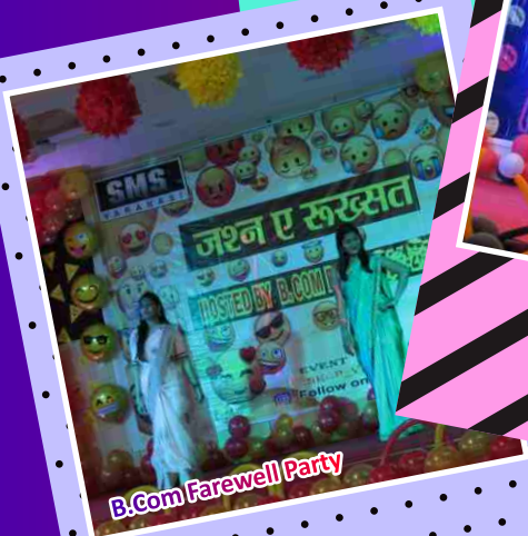
B.Com Farewell Party