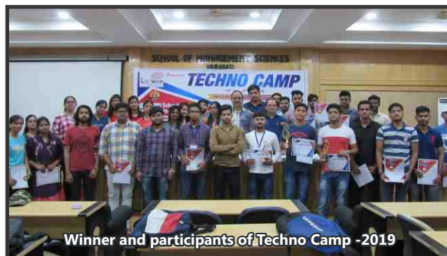
Winner and participants of Techno Camp -2019