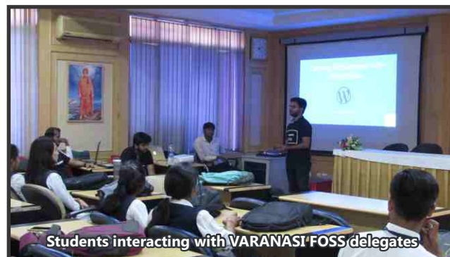
Students interacting with VARANASI FOSS delegates