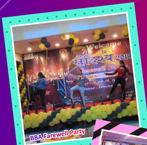
BBA Farewell Party