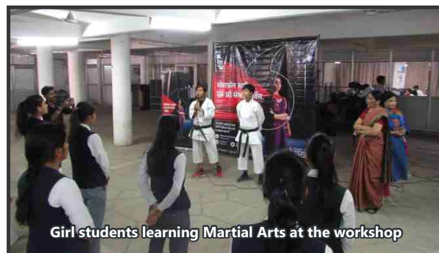
Girl students learning Martial Arts at the workshop