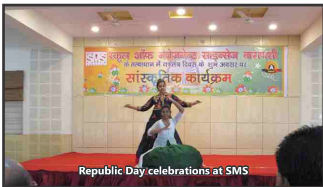
Republic Day celebrations at SMS