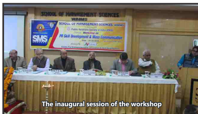
The inaugural session of the workshop