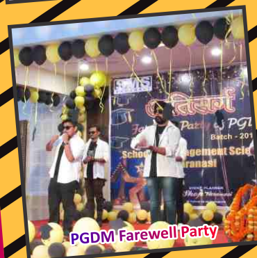
PGDM Farewell Party