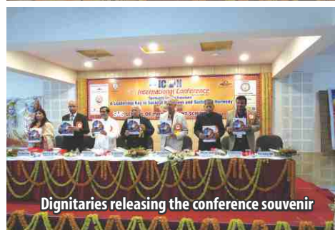
Dignitaries releasing the conference souvenir