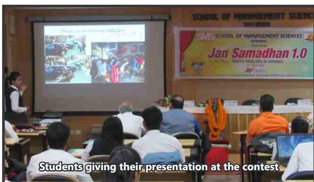
Students giving their presentation at the contest