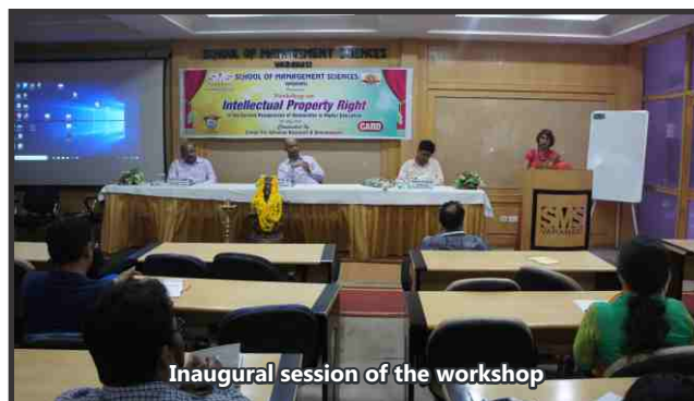
Inaugural session of the workshop