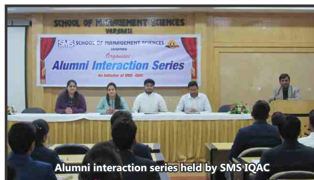
Alumni interaction series held by SMS IQAC