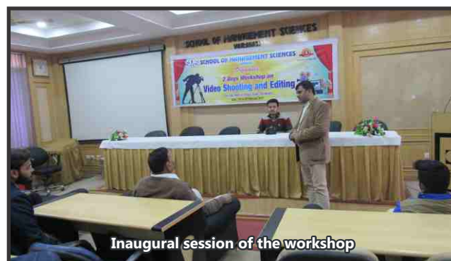
Inaugural session of the workshop

SMS, Varanasi organized a two day workshop on Video Shooting and Editing from 18th to 19th February, 2019 for BA (Hons.)- Mass Communication students. In this workshop the students learned the skills and techniques of shooting and editing of press conferences and other live events using state of the art equipments . Special emphasis was given on latest editing and mixing gadgets and softwares used by the leading news channels and PR studios.