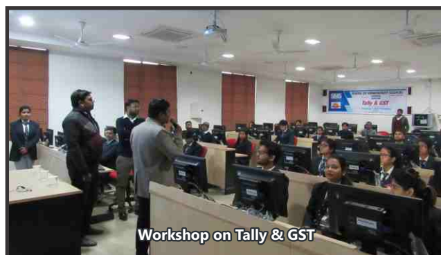
Workshop on Tally & GST