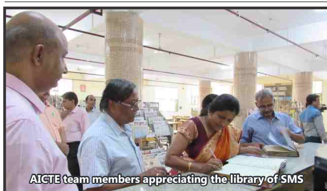
AICTE team members appreciating the library of SMS