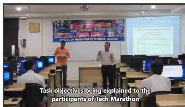
Task objectives being explained to the participants of Tech Marathon

Top three winners of the competition were provided cash prizes of Rs. 8,000; Rs. 6,000 & Rs. 4,000 in accordance with their position.