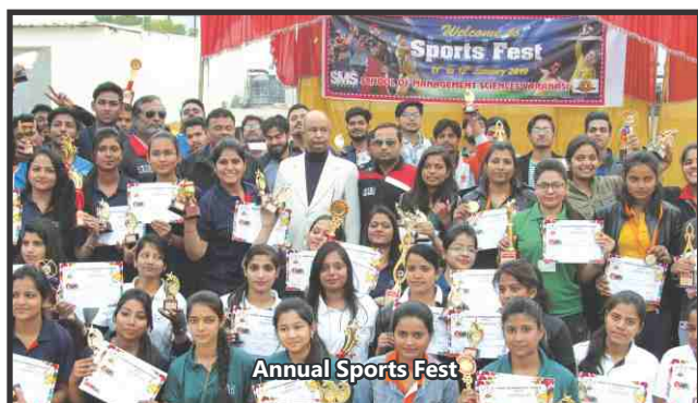
Annual Sports Fest