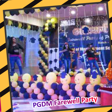
PGDM Farewell Party