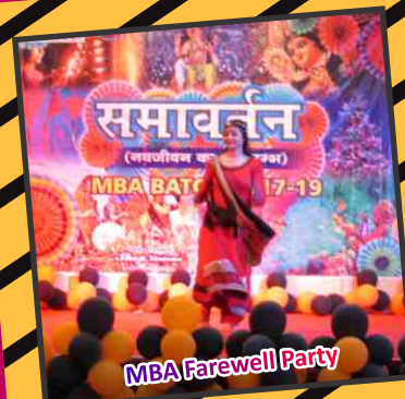
MBA Farewell Party