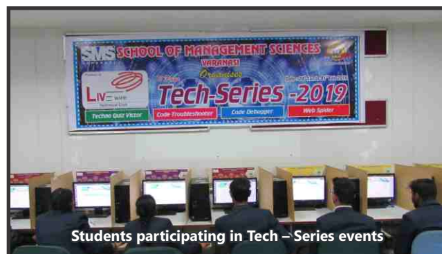
Students participating in Tech – Series events

SMS, Varanasi under the aegis of the Livewire Technical Club organized a five days competition "Tech Series – 2019" from 28th January to 1st February 2019. This series was designed for MCA and BCA students, where student can take part in various challenging events. This Event was aimed at developing and enhancing crucial skills and competencies among the undergraduate students such as planning and execution of technology based projects, teamwork and coordination, stress management, handling the work pressure, meeting the deadline, division of work, creativity and innovation. Events under Tech series were, Techno Quiz Victor - online quiz event based on IT fundamentals and programming basics, Code Troubleshooter - online code troubleshooting event, Code Debugger - corrections in erroneous programs and Web Spider - a web template based on HTML/CSS/JavaScript.