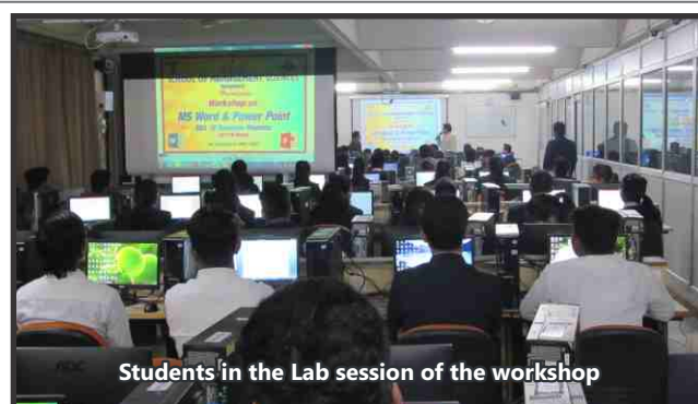
Students in the Lab session of the workshop