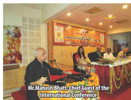
Mr. Mahesh Bhatt, Chief Guest of the International Conference

The international conference brought together notable academicians, researchers and knowledge seekers to explore the esoteric nature of spirituality. The participants exchanged their experiences of spiritual happiness and engage in eloquent dialogue on creating and sustaining spiritual harmony at individual and societal levels. The conference also provided a premier interdisciplinary colloquy for educators, practitioners and researchers to present and pursue their perspectives about the various connotations and applications of spirituality, happiness and harmony. On this occasion, the conference souvenir was released along with the latest issue of Scopus Indexed Journal “Purushartha”.