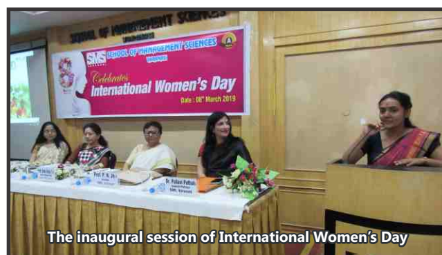
The inaugural session of International Women's Day