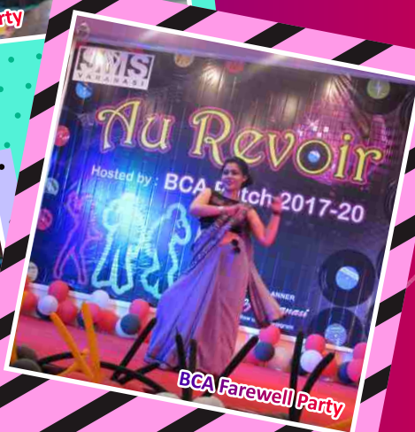
BCA Farewell Party