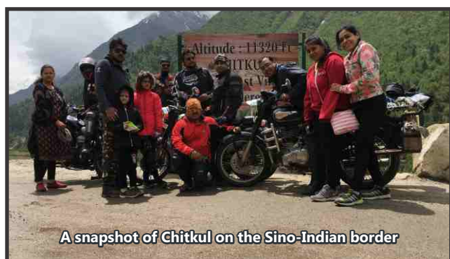
A snapshot of Chitkul on the Sino-Indian border