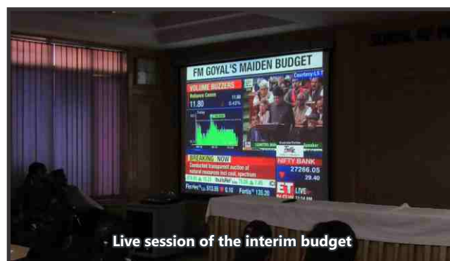
Live session of the interim budget

SMS, Varanasi organized a live budget session on 1st February 2019 for the PGDM and MBA students in the conference hall of the campus. The interim budget for the financial year 2019-2020 was presented in the parliament by Mr.Piyush Goyal, Finance Minister. The faculty members of SMS, Varanasi also explained to the students the different aspects of the interim budget in this live session. This session was organized to keep the students updated on the highlights of the budget and its impact on the Indian economy.