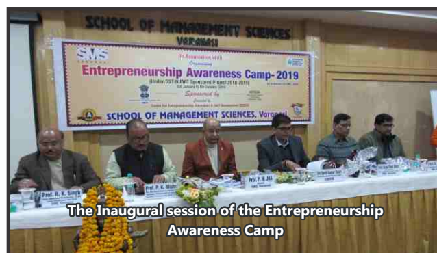
The Inaugural session of the Entrepreneurship Awareness Camp

Centre for Entrepreneurship, Innovation & Skill Development (CEISD) under the Aegis of SMS, Varanasi in association with Entrepreneurship Development Institute of India, Ahmedabad Gujarat under the initiative of SMS-IQAC organized three days Entrepreneurship Awareness Camp in its premises for BCA Students from 3rd to 5th January, 2019. This Entrepreneurship Awareness Camp-2019 was sponsored under the aegis of National Science & Technology Entrepreneurship Development Board (NSTEDB), Department of Science and Technology, Govt. of India, New Delhi under its DST-NIMAT Project 2018-19. This program also witnessed the unveiling of Edited Book “Alchemy of Leadership for Innovation & Sustainability” & UGC Listed Journal “SMS Journal of Entrepreneurship & Innovation” (volume 4 issue 2, June 2018). The prominent speakers shed their knowledge and enlightened us on following topics, Historical background of Entrepreneurship and its relevance to the present scenario, Identification of opportunities for entrepreneurs, the entrepreneurial attitude and confidence which is required while facing tough challenges in their start-ups, Support and financial assistance from government agencies, banks, financial institutions, SFCs and others-securities demanded by FIIs/Banks etc.