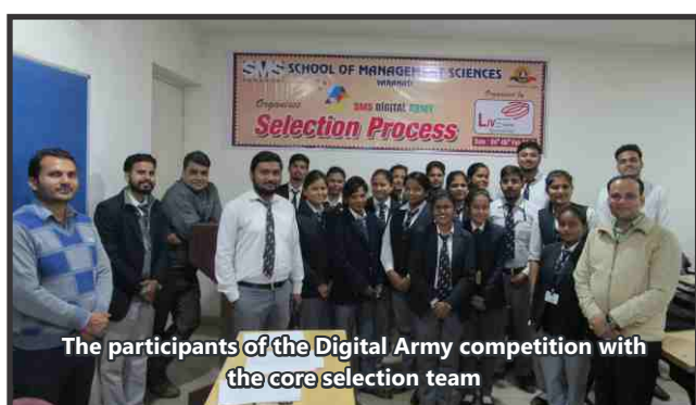
The participants of the Digital Army competition with the core selection team