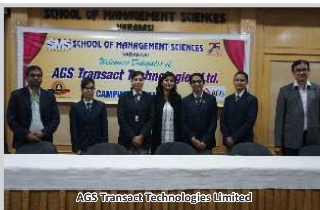
AGS Transact Technologies Limited