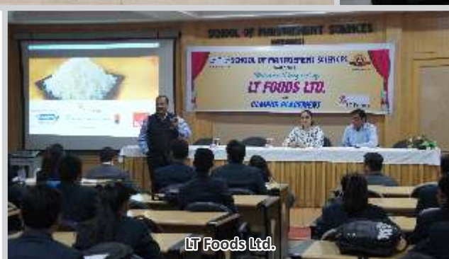
LT Foods Ltd.