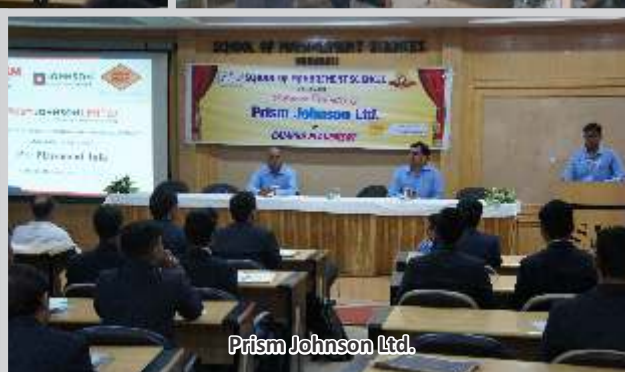
Prism Johnson Ltd.