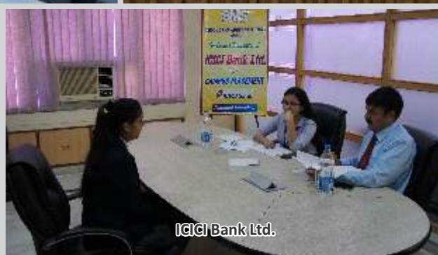
ICICI Bank Ltd.