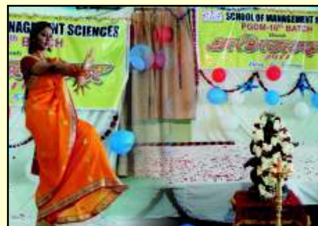
Saraswati Vandana performance