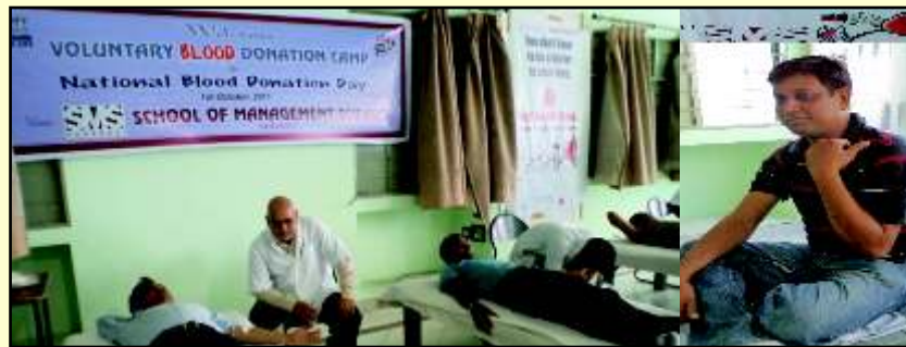
Giving Life to Others

7th Alumni Meet was conducted at SMS campus where the students from the previous batches met and remembered the good old days of the college. The Alumni Meet commenced with the interaction among the alumni students, sharing