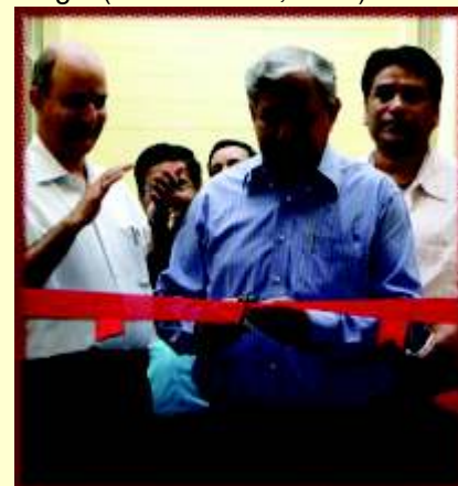
Vice Chancellor - MGKVP

The fifteenth batch of 'Bachelor of Business Administration' (BBA) and fourteenth batch of Bachelor of Computer Applications (BCA) programmes were flagged-off here at School of Management Sciences (SMS) amidst rocketing aspirations to be a part of the corporate enigma with a strong backing of academic feeders of high quality supported by the most modern techno-savvy infrastructure at the Khushipur.