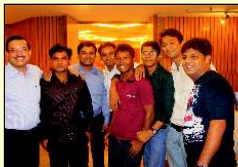
Old Days Remembered

Fun, Frolic, Smiles and rejuvenated Spirit marked the start of the academic session of MCA Batch 2011-