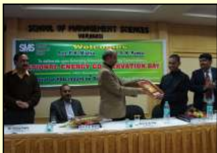
Director honoring the speaker

in a very soothing note as per understanding of the students.