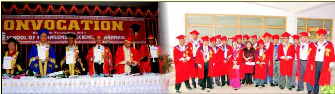
Dignitaries on the Dias during Convocation