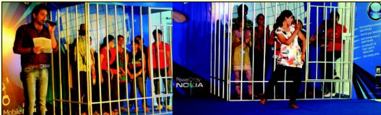
Icons waiting their turn members were also present.