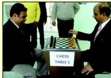
Chief Guest with Director