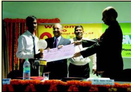
Receiving Award from Chief Guest

Leading Business School of the country, School of Management Sciences (SMS), Varanasi organized the final round of the state level competition "SMART" on November 19, 2011. Keeping up with the tradition of its commitment towards its social responsibility activities, SMS initiated this competitive event. More than 8,000