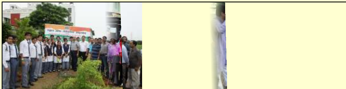
Celebrating Independence Day with Social Responsibility