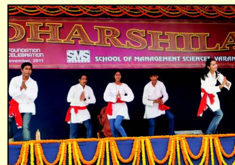
Enjoying the moment