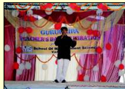
Song for Gurus

program was to search out the Iconic person among the college students who use the technology with smartness as well as trendiness. The program was named as M Cop to check the M Factor of the students.