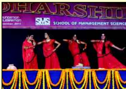
Jara Nache Ke Dikha