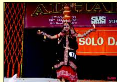
Solo dance participant