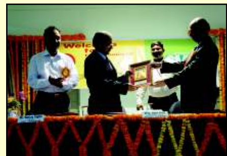
Chief Guest honored