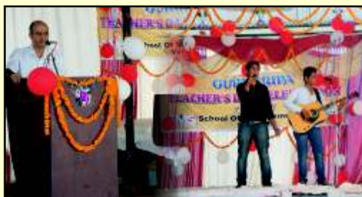
Rock Star in the making

V-tak Integrated Marketing & Event Management Pvt Ltd in association with RED FM 93.5 on behalf of Nokia conducted a College Icon program within the campus of School of Management Sciences, a prestigious institution in the field of management education. The