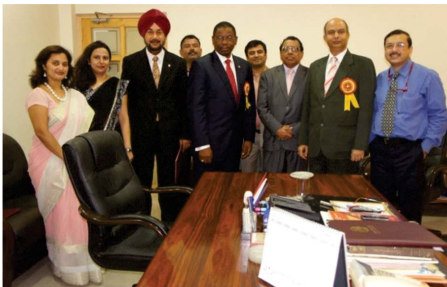
Historical moment for both Institutions

An agreement for Joint Conduction of seminar/conference and students exchange between the two institutions is already in force. Claflin University also extended support in ICON 2012 as one of the Associate Partners. A