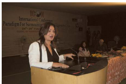
Ms. Puja Bhatt on the Dias

SMS witnessed the benign presence of Indian Cinema's dynamic and flamboyance duo Mr. Mahesh Bhatt and his daughter Pooja Bhatt. They articulately gave their version of Spirituality in the International Conference on "Spiritual Paradigm for surmounting Global