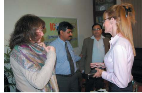
Foreign Delegates before their Interview Session