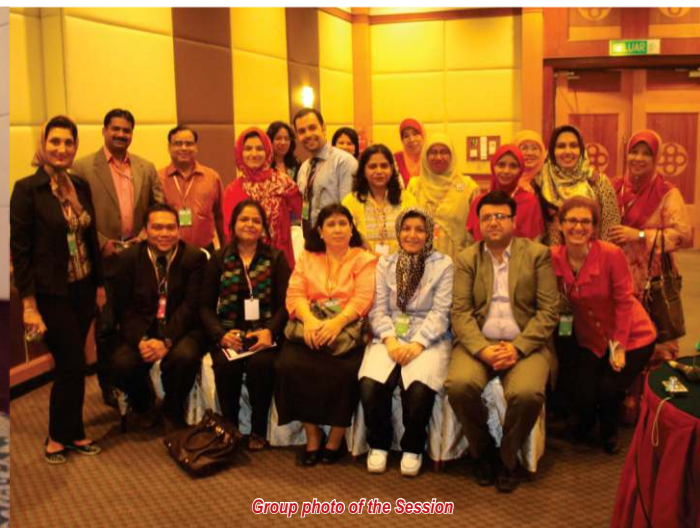
Group photo of the Session