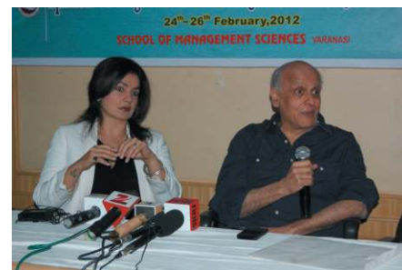
During Press Conference

Management Crisis" organised in School of Management Sciences. Mahesh Bhatt commented that there lies a difference in living a real life and the reel life of cinema. Therefore it happens that in the fight of survival and competition somewhere certain issues may not be possible to be honestly pursued