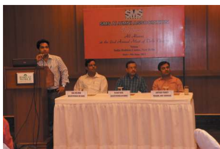
Delhi Alumni Chapter Scene