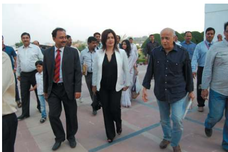
Arrival of Puja & Mahesh Bhatt