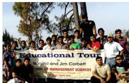
BCA Educational Tour

every year International and national educational visits are arranged. This time BCA