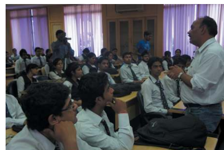
Students listening expert