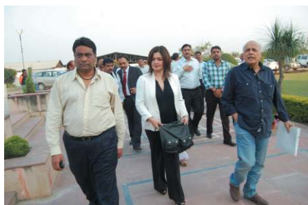
Puja & Mahesh Bhatt in the Campus with Executive Secretary

SMS witnessed the benign presence of Indian Cinema's dynamic and flamboyance duo Mr. Mahesh Bhatt and his daughter Pooja Bhatt. They articulately gave their version of Spirituality in the International Conference on "Spiritual Paradigm for surmounting Global