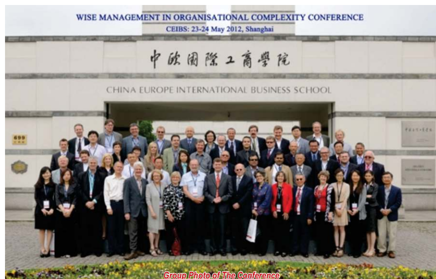
Group Photo of The Conference