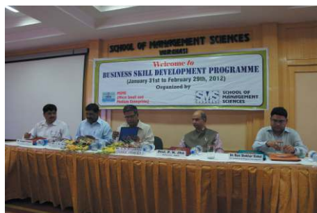
Guests on the Dias

A month long "Business Skill Development Programme" in collaboration with Micro, Small and Medium Enterprises (MSME), Ministry of MSME, Govt of India was conducted at the Khushipur Campus of School of Management Sciences from 29 th January to 28 th February 2012. Thirty students