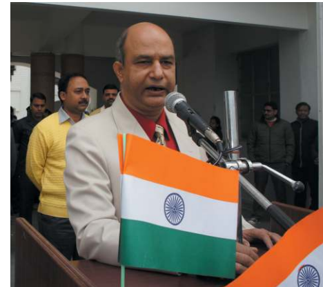
Director during Republic Day