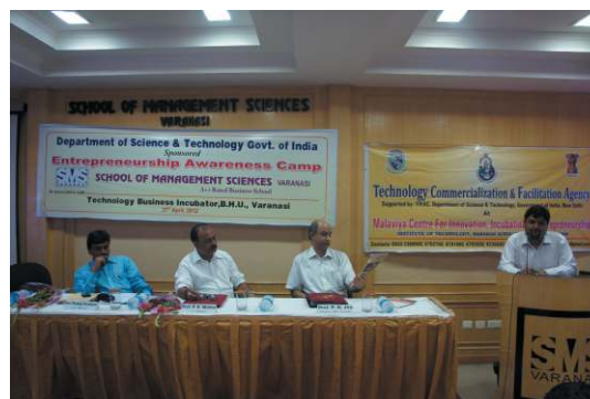
Guests during entrepreneurial awareness camp