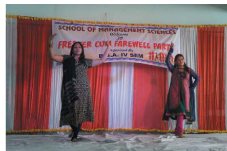
Chalo Jhume Naache

the nascent managers & the time flew away , the moment came which brought tears into the eyes of both the seniors & the juniors.