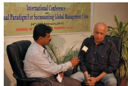
Giving Interview to SMS AV Media