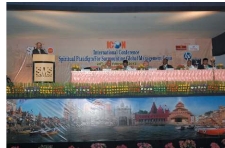
Panoramic View of ICON - 2012