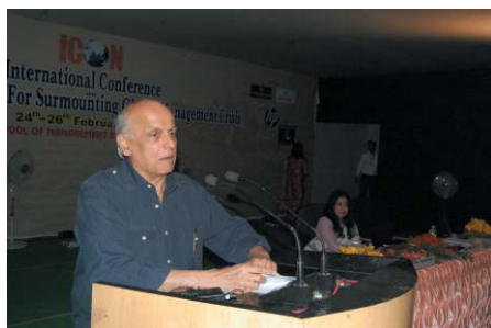
Mr. Mahesh Bhatt sharing views