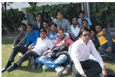
Lets see the joy

Leading hindi daily of north India, Amar Ujala News Paper organised a program connecting to campus and its youth. This program was organised in association with Idea Cellular Ltd., BIG Magic, Hero Group & other corporate giants. With an objective to search tallent through campus in entire UP, SMS was selected as a 'Campus of