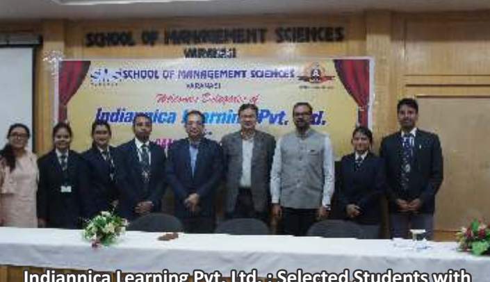
Indiannica Learning Pvt. Ltd.: Selected Students with Recruitment Team